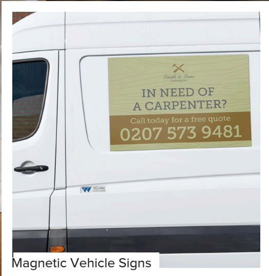
Magnetic Vehicle Signs