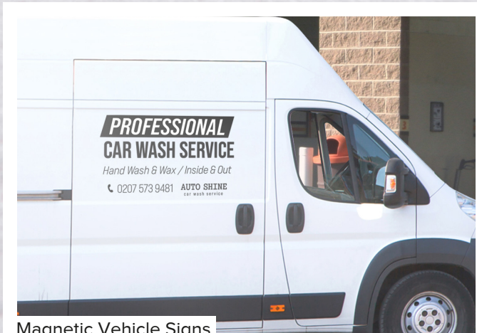
Magnetic Vehicle Signs