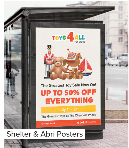
Shelter & Abri Posters