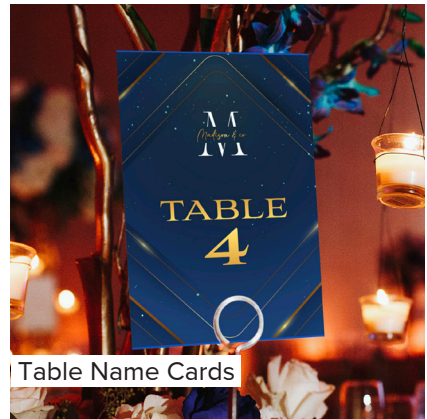
Table Name Cards