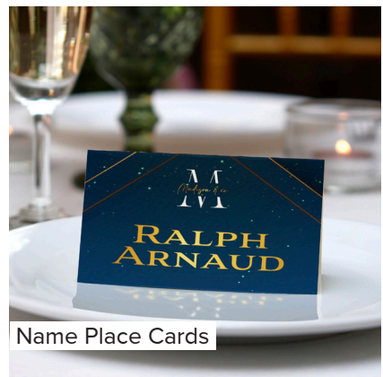
Name Place Cards