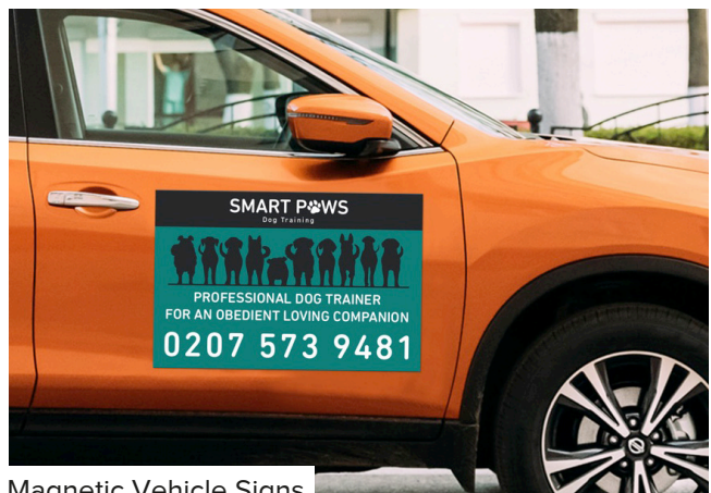
Magnetic Vehicle Signs