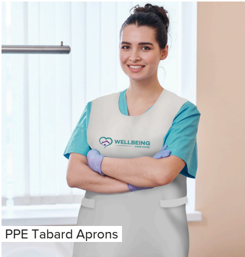
PPE Tabard Aprons