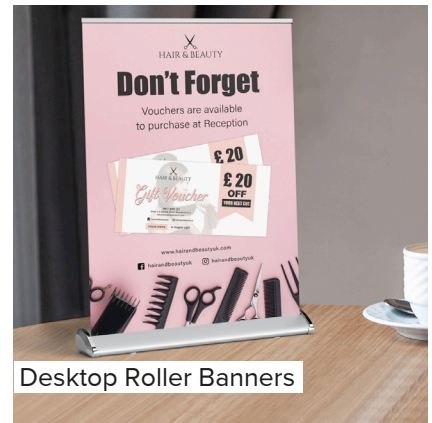
Desktop Roller Banners